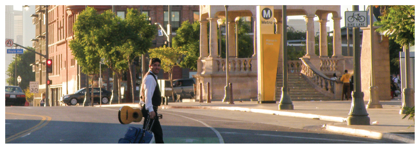
A man crossing the street in Boyle Heights

As the city's primary governing body, the Los Angeles City Council is largely responsible for creating the public policies that maintain this obstruction. The Council both sets citywide laws for land use, planning, and zoning and grants entitlements for individual projects. The latter responsibility allows the Council to make land use policy on a project-by-project basis. Furthermore, each councilmember has significant discretion over what will be built in their district. The result is a system where land use policy is essentially a series of ad hoc decisions made by individuals, rather than a set of predetermined standards applied citywide.